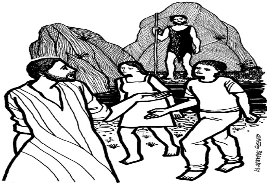
SAINT BEUNO'S OUTREACH IN THE DIOCESE OF WREXHAM

"I waited, I waited for the Lord And he stooped down to me; he heard my cry." [Psalm 39]