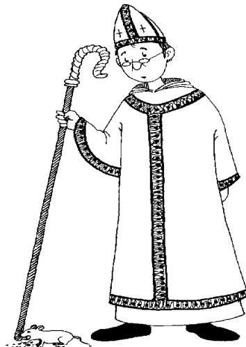
The Lord is a gnawesome God

These collection are only made twice a year So please give generously.